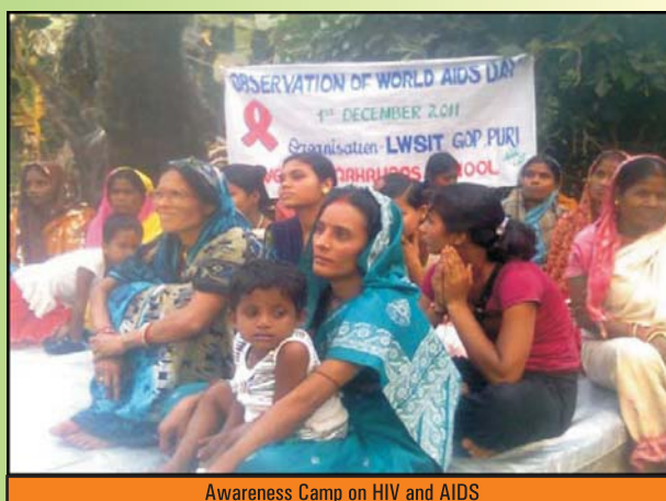
Awareness Camp on HIV and AIDS

On December 17, 1999, the United Nations General Assembly designated 25 November as the International Day for the Elimination of Violence Against Women (Resolution 54/134). Each year, a particular theme is decided. Theme for 2011 was eliminating discrimination against women in order to end gender-based violence. This campaign reminds us that violence against women is one of the most widespread human rights abuses in all countries.