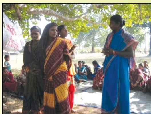
Role-play by the participants commemorating Human Rights Day

It is a clarion call to the government to perk up access and ensure basic rights to HIV victims while also giving additional focus to prevention, treatment, care and support for HIV victims. With complete support of the United Nations, the "Getting to Zero" campaign is scheduled to run until 2015 striving to see an end to AIDS related deaths.