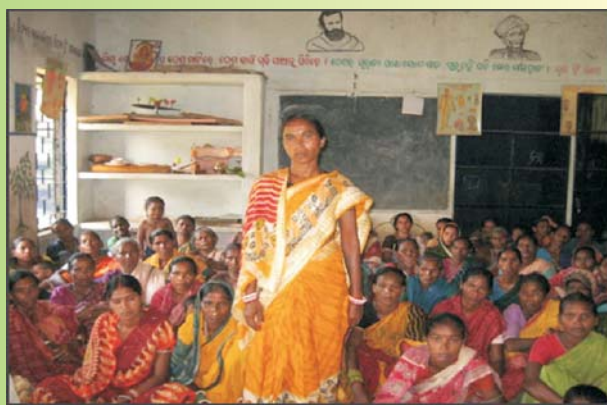
A young woman participating in the discussion on Violence Against Women

This quarter all LWSIT units across India observed Human Rights Day, International Day for Elimination of Violence Against Women, and World AIDS Day with equal dedication and vigour. The observance of these important days in the units gives an opportunity to the community to learn about their rights and empower them further to lead a dignified and respectable life. All the partner communities observed and organised the programs for the day with guidance from LWSIT. The government officials present during the program, thanked LWSIT for their selfless service for the downtrodden of the society.