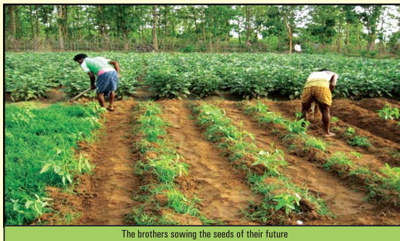
The brothers sowing the seeds of their future