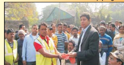
Councillor distributing hand gloves and gum boots to the workers

Hand Gloves and Gum boots were distributed to the Kolkata Municipal Garbage collectors of Ward No 54. This programme is in continuation to the Green Entally program.