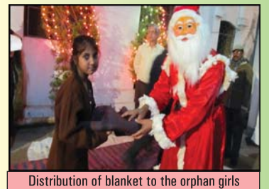
Distribution of blanket to the orphan girls