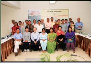
Participants at the AZEECON Summit, 2011

The AZEECON summit along with a workshop on 'Communication' was scheduled from 5 th to 9 th December 2011 in Dhaka, Bangladesh. The Executive